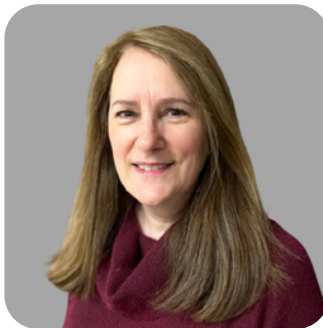
Virginia Tibbetts District #7